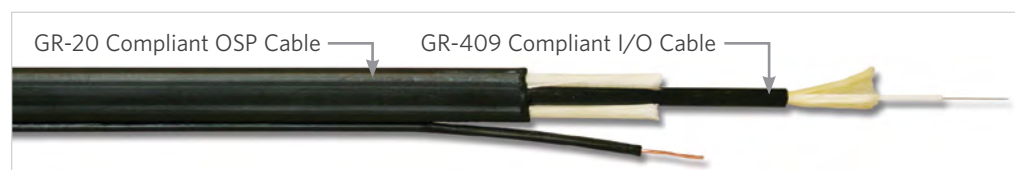
Superior Essex FTTP Tight Buffered Indoor/Outdoor Drop (Series W7)