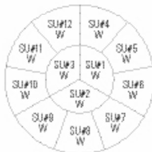
600-Pair Core Alternate 12-SU50