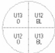
50-Pair Core 2-U12 and 2-U13