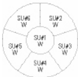
600-Pair Core 6-SU100