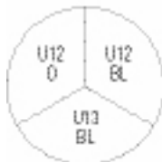
37-Pair Core 2-U12 and 1-U13