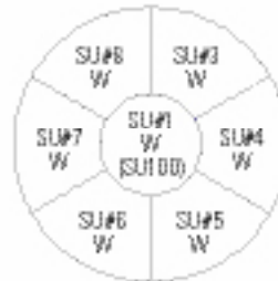
400-Pair Core 1-SU100 and 6-SU50