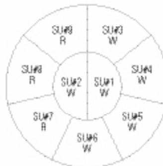
900-Pair Core 9-SU100