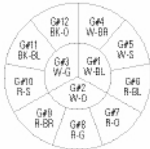
300-Pair Core Alternate 12-G25