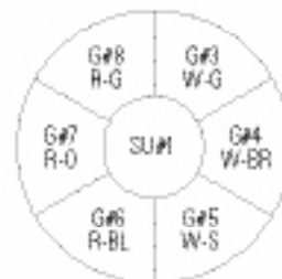
200-Pair Core 1-SU50 and 6-G25