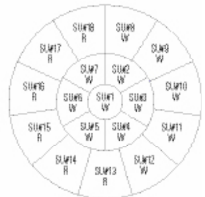
900-Pair Core Alternate 18-SU50