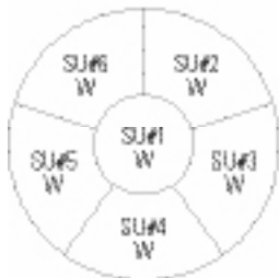
300-Pair Core 6-SU50