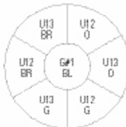
100-Pair Core 1-G25, 3-U12 and 3-U13