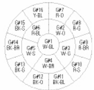
400-Pair Core Alternate 16-G25