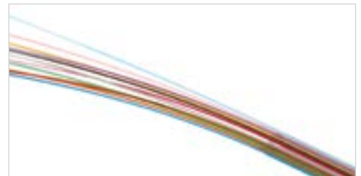
Removing the matrix leaves individually accessible fibers.