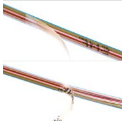
The ribbon matrix peels cleanly from both sides of the fiber.